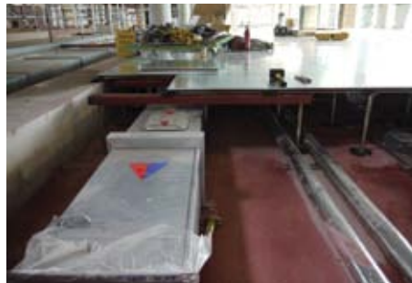
Kingspan is installing bridging sections to cross the sealed air plenum.

The new building will meet high energy saving standards with additional features including solar thermal panels using the sun's rays to generate hot water and photovoltaic panels creating renewable electricity.