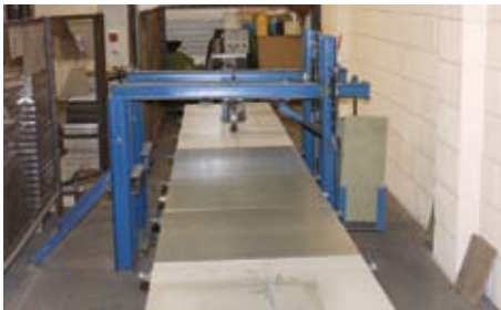
Our existing rolling load facility.

Carl will also be placing particular emphasis on further increasing the type and volume of material that we recycle, to further reduce waste whilst at the same time also making our carbon footprint even lighter.